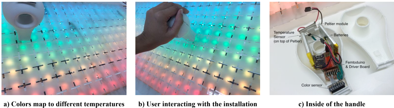
Figure 1. Overview of the “Feel & See the Globe” installation

3 Zhejiang University, China. {yikun,xinyu}@ahlab.org